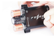
INSET 3PCS 1.5V AA BATTERY WITH THE CORRECT POLAR IN AA BATTERY BOX