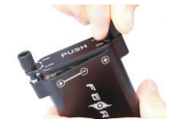
SCREW UP BOTH NUTS ON AA BOX