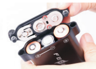
PUT THE SCREW CASE IN THE RIGHT DIRECTION