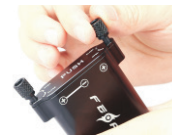
BOTH NUTS ARE UNSCREW