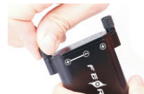
UNSCREW THE NUT