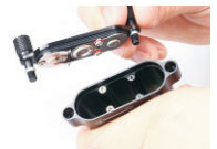
REMOVE THE SCREW CASE FROM BATTERY BOX